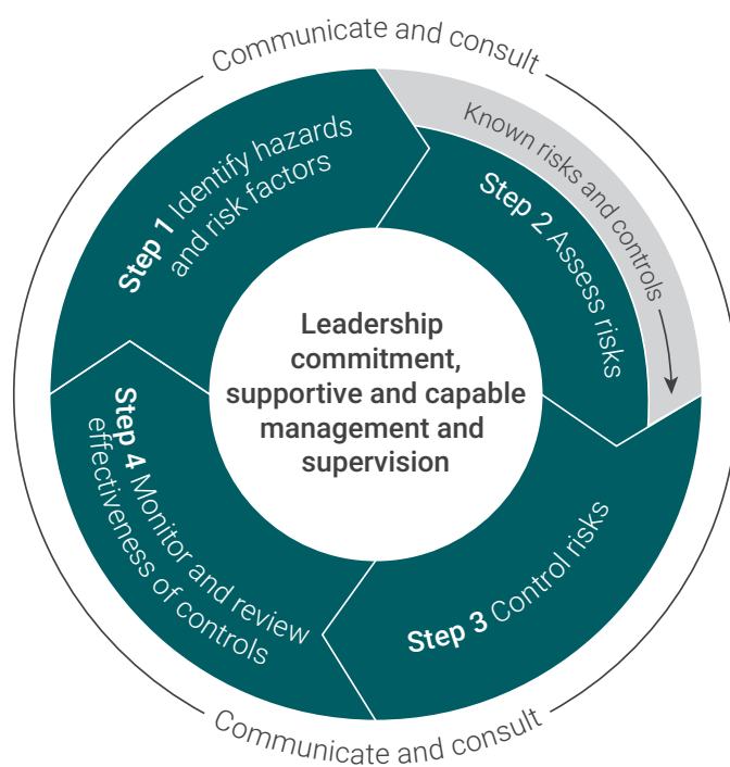
Figure 3.1 Overview of the risk management process (adapted from Safe Work Australia).

The following sections describe each step.